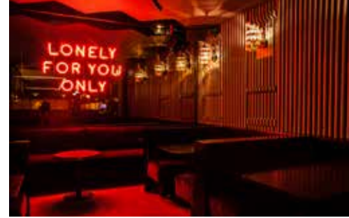
GOGO BAR 125 Flinders Lane, Melbourne eat@chinchinrestaurant.com.au