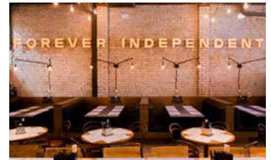
HAWKER HALL 98 Chapel St, Windsor eat@hawkerhall.com.au