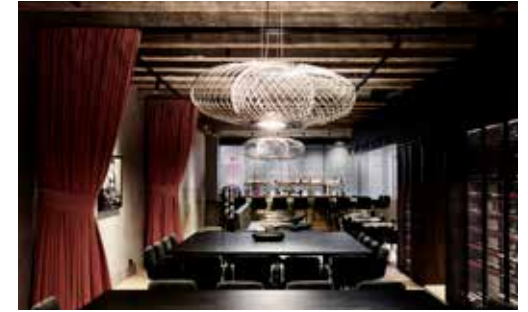
KISUMÉ 175 Flinders Lane, Melbourne eat@kisume.com.au